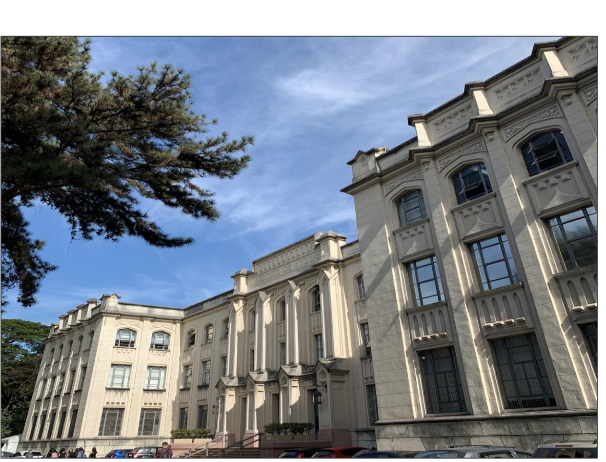
School of Public Health, São Paulo, Brazil

Prior to the beginning of the semi-structured interviews, mandatory training sessions were provided on the collection of qualitative data at the School of Public Health and NUDHES.